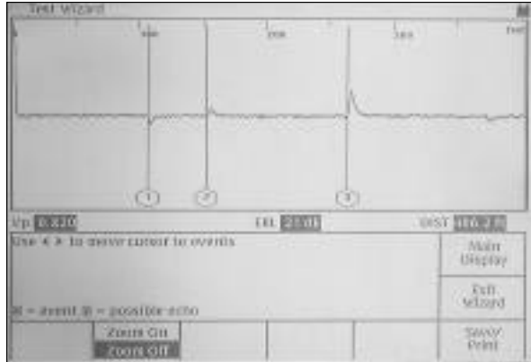
TestWizard Testing automatically marks faults.

TestWizard™ Testing automatically finds multiple faults on coax cable. There's no longer a need to interpret the results; they're clearly marked. TestWizard testing automatically adjusts and optimizes gain, averaging, and pulse width to provide the best possible resolution while maximizing the instrument's ability to find all the problems on your cable – even small problems missed by most other TDRs. All you do is press the yellow TestWizard button, select the cable type, length, and number of events to display; then view the results. If you want to measure the Return Loss of an event, simply jump the cursor to the event, and CableScout TV220 automatically reports the Return Loss. Technicians no longer have to be afraid of erroneous or unreliable results with a TDR. CableScout TV220 with TestWizard testing makes every user an expert!